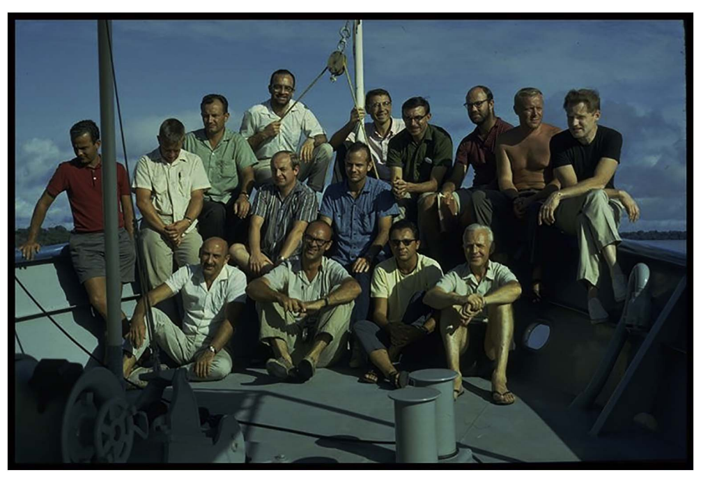
Fig. 3. Researchers and crew of the 1967 Alpha Helix Expedition to the Amazon.